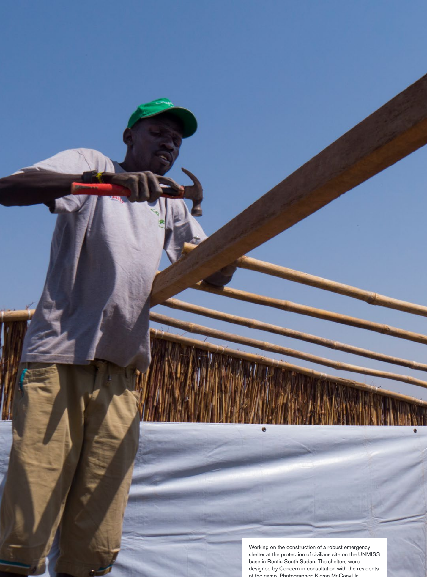
Working on the construction of a robust emergency shelter at the protection of civilians site on the UNMISS base in Bentiu South Sudan. The shelters were designed by Concern in consultation with the residents of the camp.