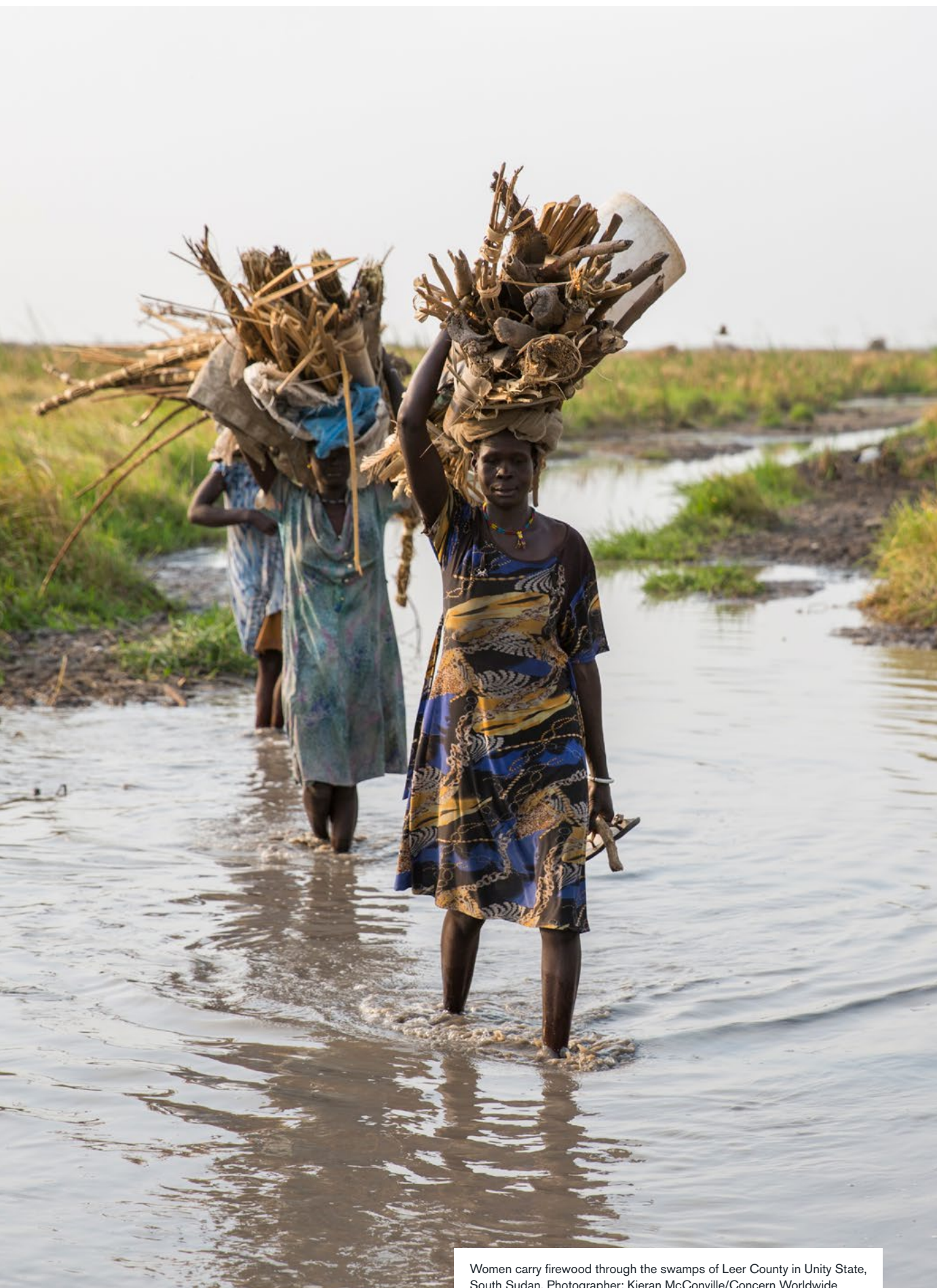
Women carry firewood through the swamps of Leer County in Unity State, South Sudan.