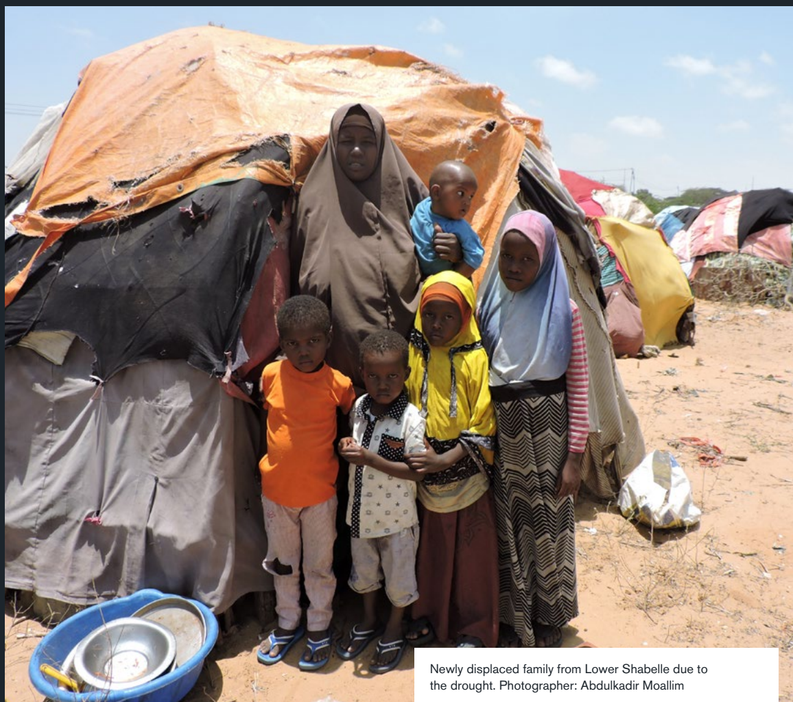
Newly displaced family from Lower Shabelle due to the drought.

targeted, including the elderly, pregnant and lactating women, single mothers, those living with disabilities, and those who were chronically ill. Money was transferred by mobile phone, and Concern and partner staff followed-up by phone call to ensure the targeted beneficiaries were reached. In total, 400 vulnerable households were reached with unconditional cash transfers, an agreed best approach in this context as cash transfers aid livelihood resilience and support beneficiaries to determine and meet their most immediate needs (often food). Mobile money transfer is also very discreet, which significantly reduces aid diversion, security- and protection-related risks.