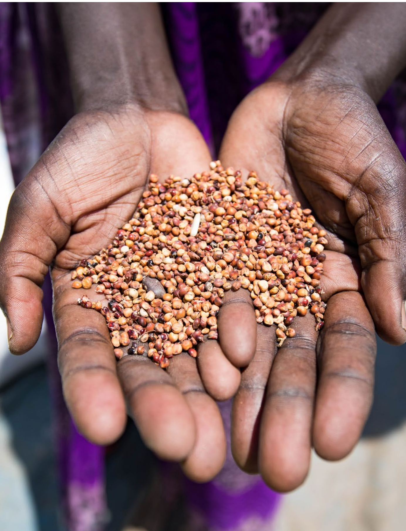
A woman holds up grains distributed by Concern, this is part of the support provided to over 135,000 people living in the protection of Civilians (PoC) site in Bentiu, South Sudan.