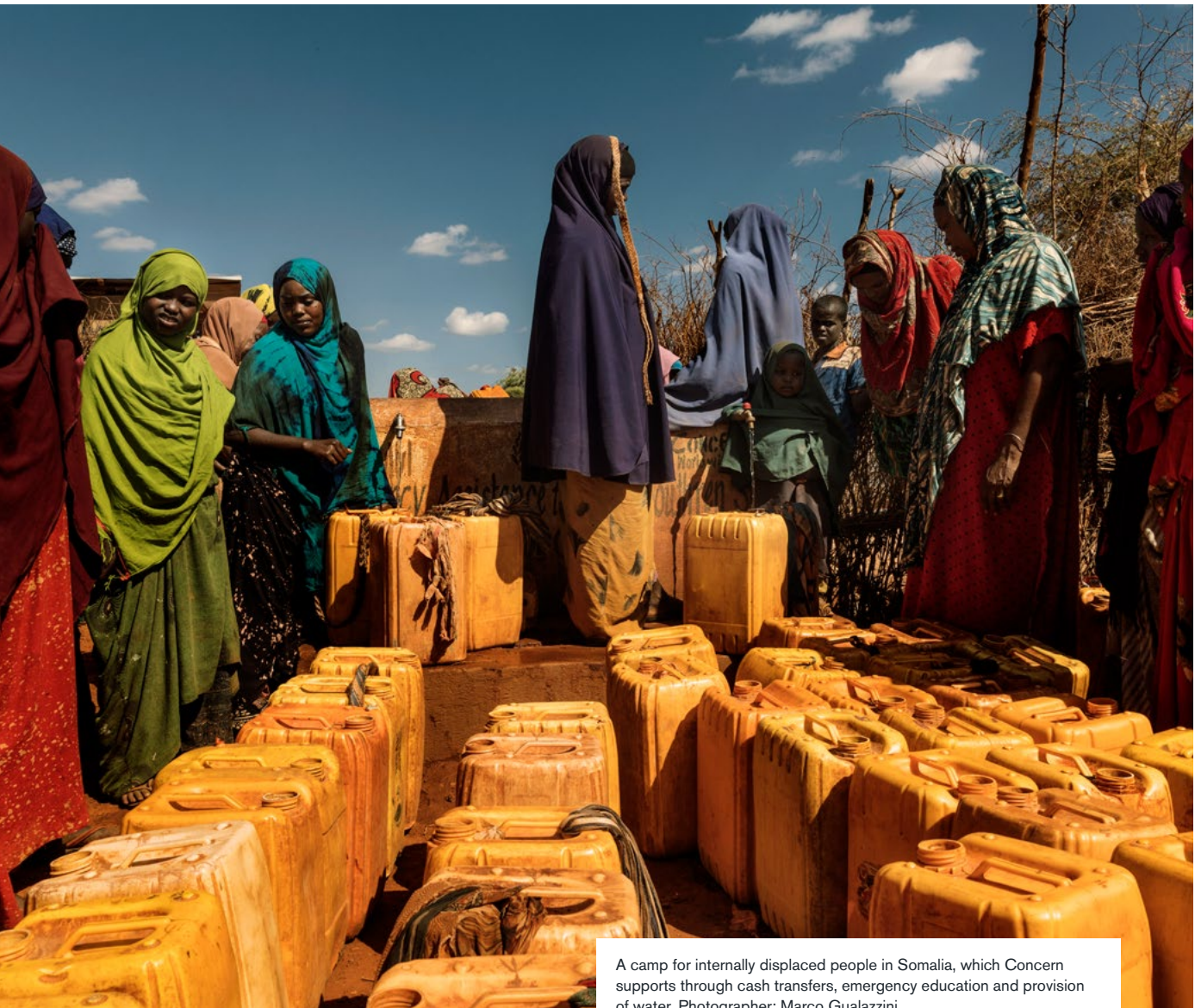
A camp for internally displaced people in Somalia, which Concern supports through cash transfers, emergency education and provision of water.

Together, existing research provides a solid evidence base for understanding general trends in the relationship between conflict and food security. However, the specific pathways through which conflict has the most pronounced impact, and the characteristics of individuals, households and communities that make them more or less resilient to those impacts, are highly context-specific, and often poorly documented in crisis. For these reasons, first-hand accounts of these local conditions are vital to enriching our understanding of conflict's impacts on food security, and the responses it requires.