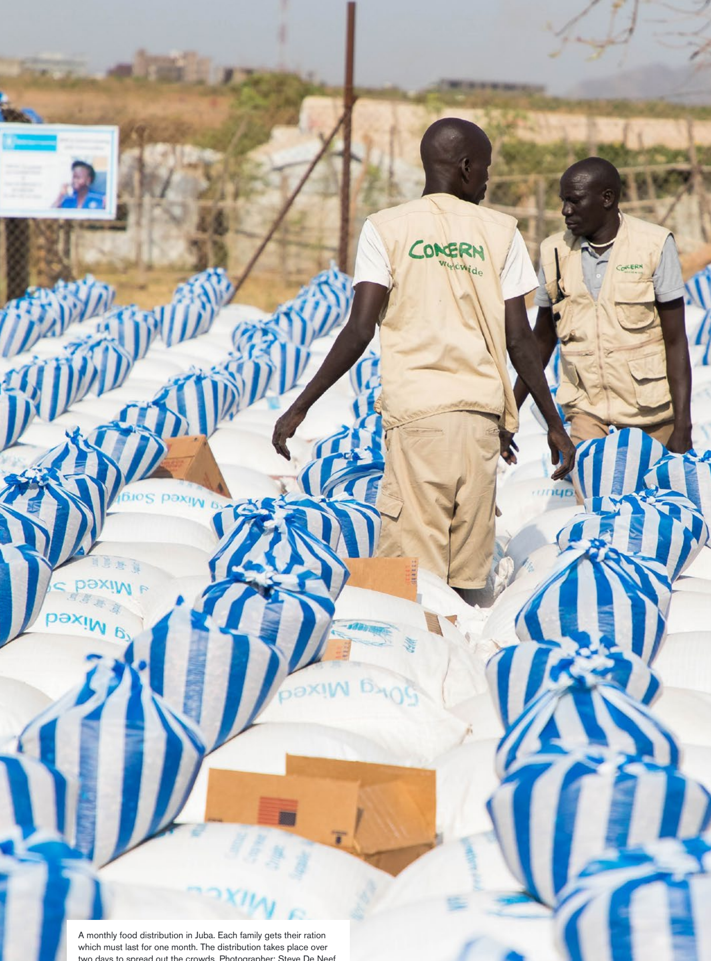
A monthly food distribution in Juba. Each family gets their ration which must last for one month. The distribution takes place over two days to spread out the crowds.