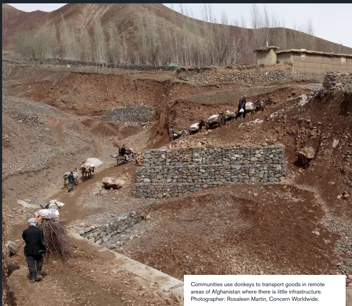
Communities use donkeys to transport goods in remote areas of Afghanistan where there is little infrastructure.

* All names have been changed for security purposes